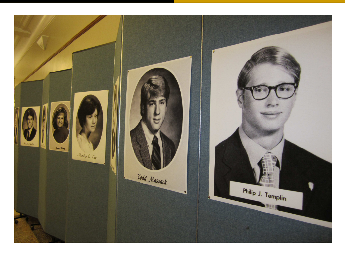
The Way They Were!